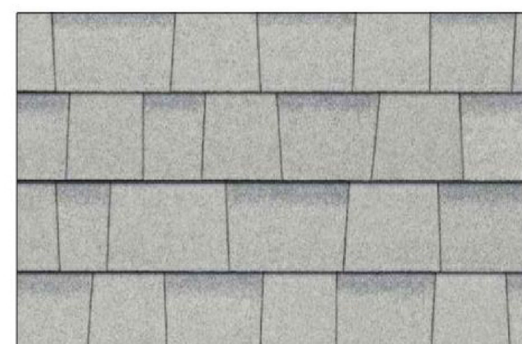
OWENS CORNING SHINGLES IN SHASTA WHITE