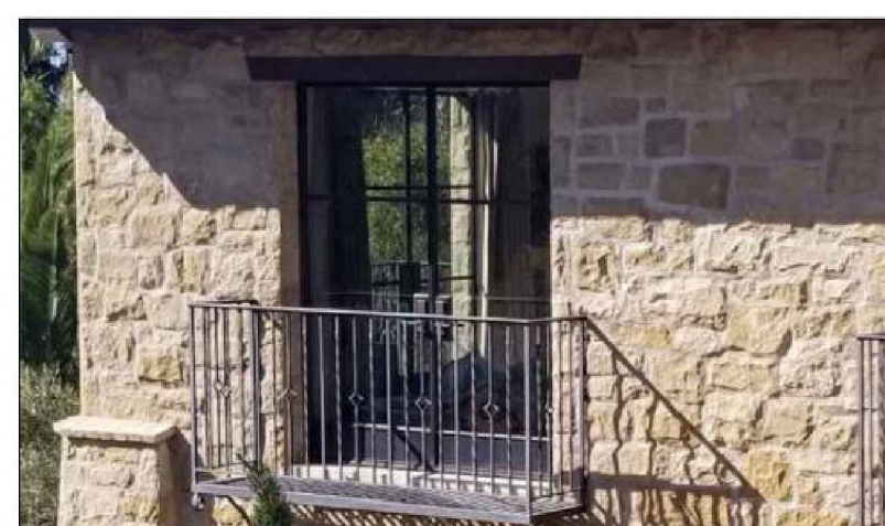
SANTA BARBARA SANDSTONE